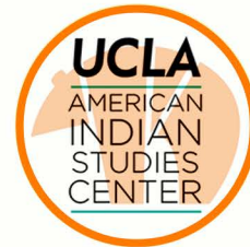
UCLA AMERICAN INDIAN STUDIES CENTER main.aisc.ucla.edu