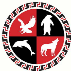
GABRIELINO-SHOSHONE NATION OF SOUTHERN CALIFORNIA gabrelinoshoshone.org