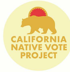
CALIFORNIA NATIVE VOTE PROJECT canativevote.org