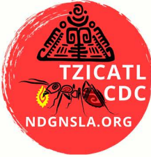
TZICATL CDC tzicatl.org

Visit www.nw2c-la.org to learn about our extraordinary partners